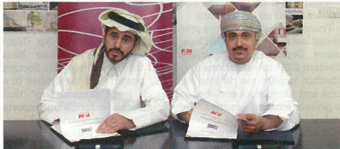
SIGNING CEREMONY: The MoU allows both companies to jointly deliver expert design and project management services not just in Qatar but internationally.